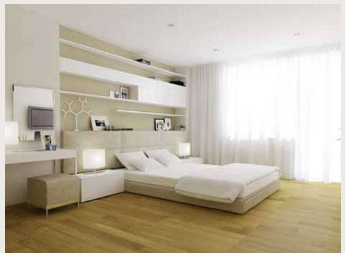
Spacious bedroom areas