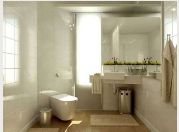
Modern and functional bathrooms