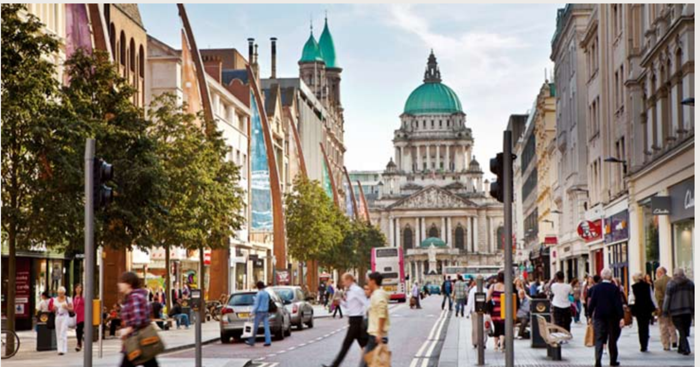
Belfast City Centre

A limited opportunity for investors to buy-to-let these apartments at prices that are discounted by 10% when compared to current market values.