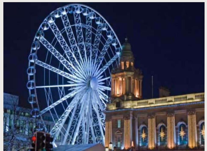
The Belfast Wheel

Today Belfast City has: Europe's largest IT hub; the World's biggest Titanic-themed attraction , a new entertainment centre, home of Game of Thrones, City of Ember; and Belfast Metropolitan College & Queens University.