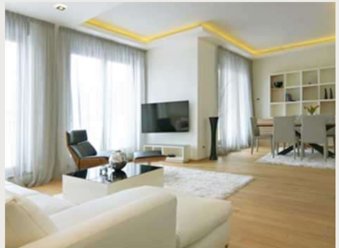
Luxury living space in the heart of Belfast City Centre