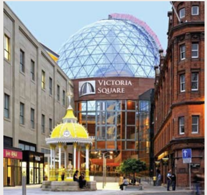
Victoria Square Shopping Centre | Belfast City Centre

Property in Belfast offers a low entry price point compared to other major UK cities and comes with a track record of long term stability. A buy-to-let investment in this thriving community is an ideal way to create, or diversify your property portfolio. The letting demand for new apartments placed within the city centre of Belfast on the back of recent job announcements remains higher than supply and is